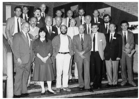
Fig. 3. Participants at the inaugural meeting in Canterbury in 1987